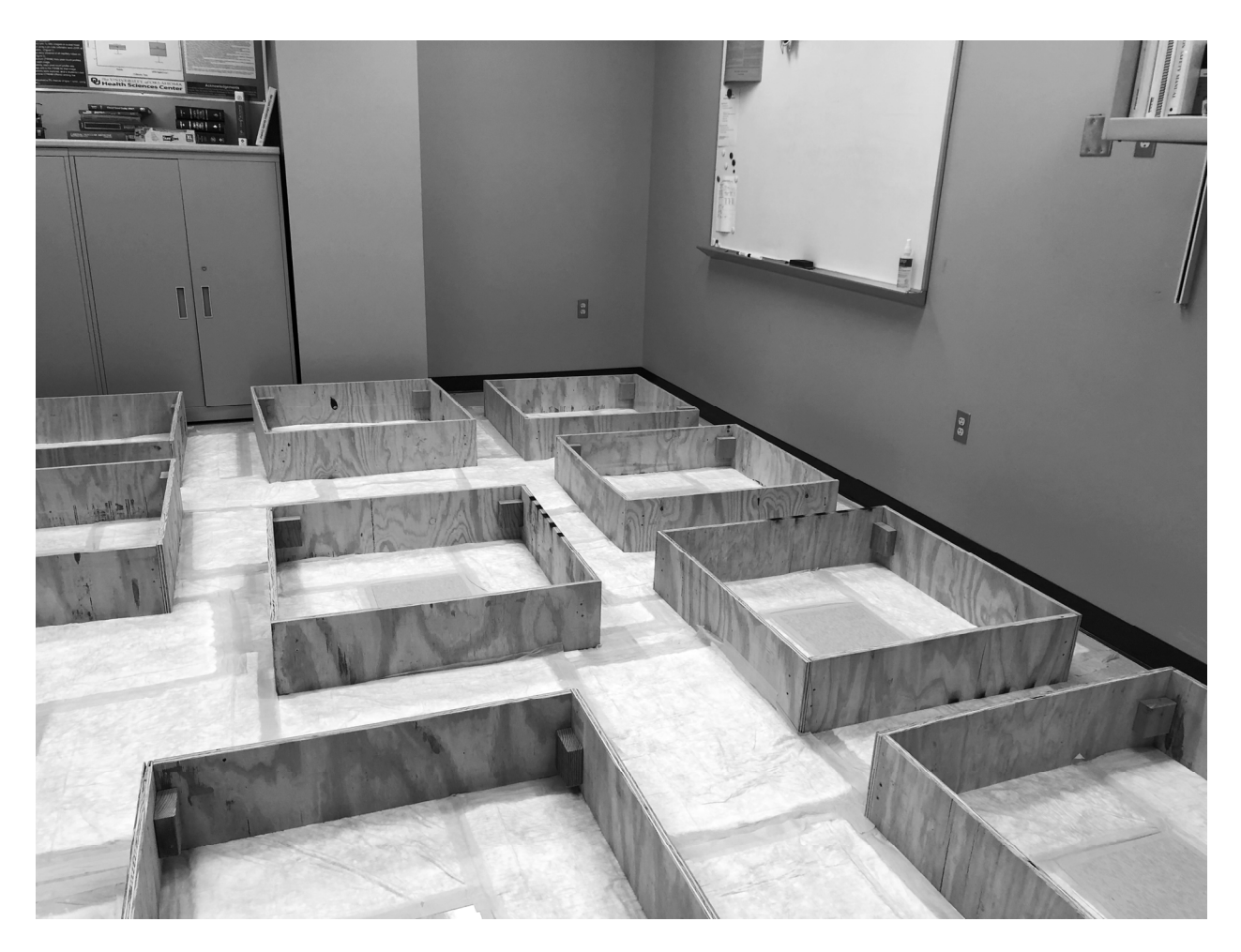
Figure 1: 3ft<sup>2</sup> Plywood Sample Boxes and Absorbent Pads Ready for Controlled