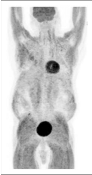
FIGURE 1. Effect of exercise on skeletal muscle ^{18}\text{F} -FDG uptake. Maximum-intensity-projection image of ^{18}\text{F} -FDG PET study demonstrates prominent diffuse ^{18}\text{F} -FDG uptake in skeletal and cardiac muscles in patient who performed strenuous exercises in the 2 d before undergoing PET.

(glucose transporter), thereby rapidly and efficiently shunting ^{18}\text{F} -FDG to organs with a high density of insulin receptors (e.g., skeletal and cardiac muscles), resulting in altered radiotracer biodistribution and suboptimal image quality (23).