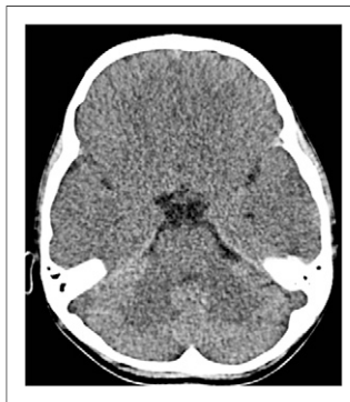
FIGURE 1. Non-contrast-enhanced CT scan showing diffuse cerebral edema, bilateral sulcal effacement, and loss of gray matter-white matter differentiation. Occipital lobe is spared.