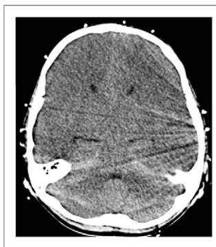
FIGURE 3. Follow-up CT scan showing progressive diffuse cerebral edema and interval development of basal cistern effacement. These findings were compatible with impending transtentorial herniation.

the hot-nose sign) due to shunting of carotid blood flow to the maxillary branches (4,5).