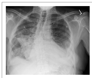
FIGURE 2. Chest postero-anterior radiograph that was completed approximately 12 h before lung scan.