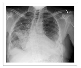
FIGURE 2. Chest posteroanterior radiograph that was completed approximately 12 h before lung scan.