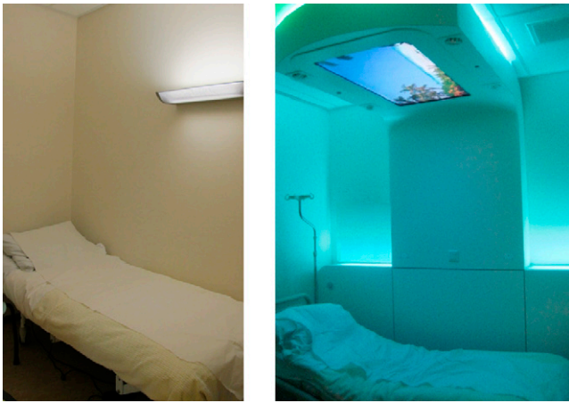
FIGURE 1. (Left) Uptake room without audiovisual installation (control). (Right) Uptake room with audiovisual installation (intervention).

assist the nuclear medicine physician with 18 F-FDG injection. The control panel, positioned directly outside the uptake room, let the staff control the audiovisual installation.