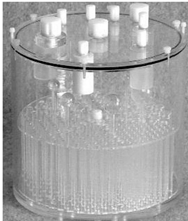
FIGURE 1. Esser Flangeless PET Phantom with inserts.

The phantom with all the inserts was filled with 5.7 L of distilled water having an activity of either 210.9 or 632.7 MBq (5.7 or 17.1 mCi) of ^{18}\text{F} -FDG to get a background