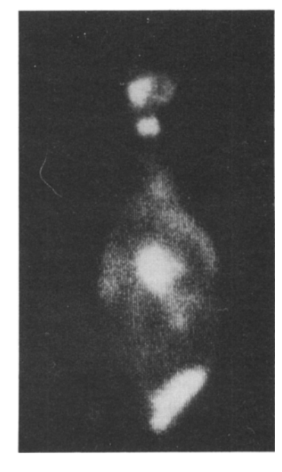
FIG. 3. Whole-body radioactivity present in rabbit 60 min after intravenous administration of sodium pertechnetate. Scintiscan shows salivary glands, thyroid, intestine, and urinary bladder.