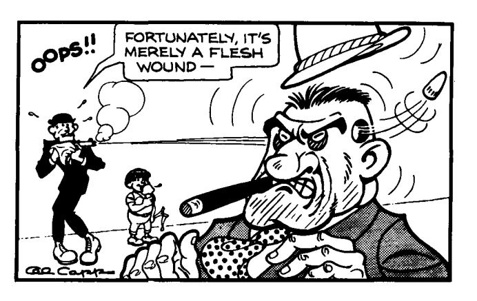
FIG. 1. Things are seldom what they seem. [Figure reprinted by permission of AI Capp.]

The posterior fossa and the position of the vascu-