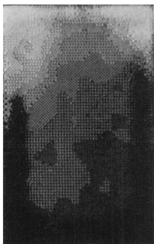
FIG. 3. Transmission image shows lung areas, cardiac silhouette, and subdiaphragmatic border.

then the patient is placed on the transmission wedge. A uniform flood source is positioned inside the open edge