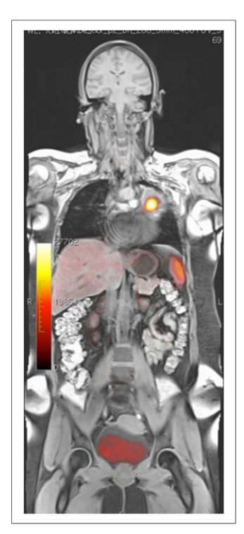
FIGURE 2. Example of PET/ MR image shown to demonstrate resultant images in informational video.

Feedback from the patients was positive. They considered that the work and effort invested had succeeded in creating a useful tool to help people who are facing not