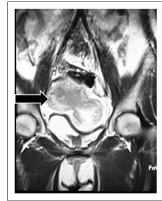
FIGURE 3. MR imaging of abdominopelvic region. Large, well-defined solid mass is seen in continuity with uterus, compatible with large subserosal myoma (arrow).

Few studies of technetium-labeled octreotide compounds can be found in the literature. ^{111}\text{In} -labeled octreotide scintigraphy, although a broadly used and helpful technique for the detection of somatostatin-expressing tumors, has several limitations such as high radiation burden, high cost, and limited availability. To overcome these shortcomings, octreotide compounds have been labeled with ^{99m}\text{Tc} . In one study, the diagnostic results of ^{111}\text{In} -octreotide scintigraphy and ^{99m}\text{Tc} -hydrazinonicotinamide DOTATOC/DOTATATE scintigraphy were found to be identical in 24 patients with different pathologic conditions (5).