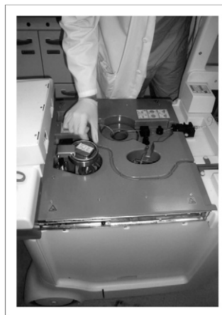
FIGURE 1. The Intego (Medrad) shielded injection device.

Manual drawing up and dispensing of the prescribed radiopharmaceutical using unit doses ( n = 27 ) yielded a mean administered dose to patients of 480.7 \pm 66.2 MBq ( 12.99 \pm 1.79 mCi). The infusions using the automated injection device ( n = 34 ) delivered a mean administered dose to patients of 431.9 \pm 22.7 MBq ( 11.67 \pm 0.61 mCi) (Table 1). When compared with the automated infusions, the manual technique delivered a wider dispersion of the administered dose, with increased SE (Table 2). Furthermore, the mean difference of 48.8 MBq (1.32 mCi) between patient doses was statistically significant by the 2-tailed t test ( \alpha = 0.05 , t = 4.02 , P < 0.001 ). Intuitively, technologist dose would be lower using the technique that administered lower doses, that