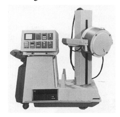
Elscint's Mobile I

Among the drivable cameras is the Mobile I, latest addition to the line of Elscint, Inc. It is the largest of the mobile cameras in weight at 1,700 lb, but is compact at only 30 in. wide by 59 in. long. The Mobile I also offers