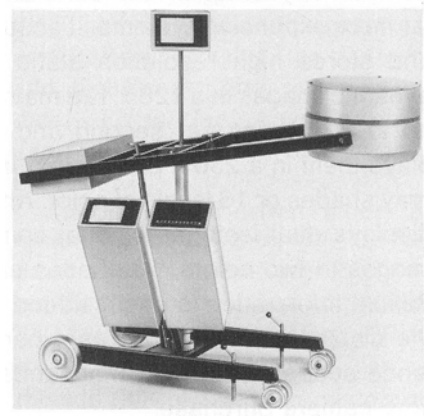
G.E. PortaCamera II

Most venerable and now cheapest of the moveable scintillation cameras is General Electric's Porta-Camera™, first introduced by Nuclear Data in 1973 at SNM's San Diego meeting. The latest version of this system was also on display among the Dallas exhibits and is dubbed PortaCamera II. The up-