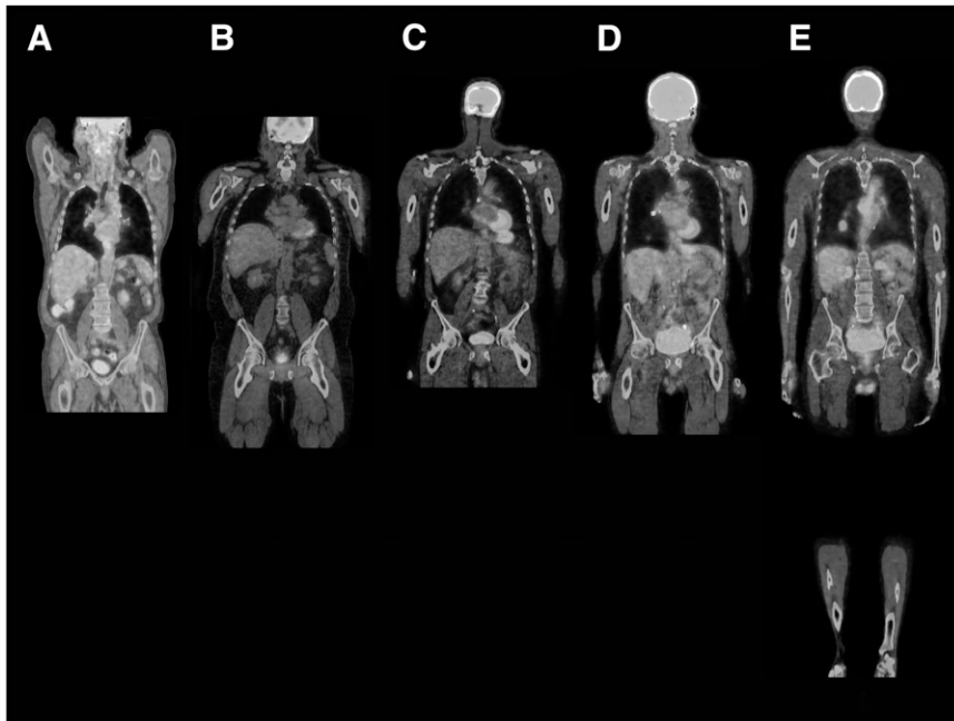
FIGURE 1. FOVs were categorized into 5 anatomic scan lengths: base of skull to upper thigh (A), base of skull to mid thigh (B), top of head to upper thigh (C), top of head to mid thigh (D), and top of head to bottom of feet (true whole-body) (E). (A color version of this figure is available as a supplemental file online at http://tech.snmjournals.org/ .)

is likely that the term WB in these references rarely meant true whole-body. The axial co-scan range is vendor-dependent; however, both anatomic scan length and imaged FOV are selected by the PET/CT center on the basis of axial co-scan range, capability of the scanner, and type of cancer being evaluated. Currently, the co-scan range for combined CT and PET is approximately 145 cm for most of the PET/CT scanners offered by major vendors of medical imaging equipment (11). Therefore, true whole-body PET/CT may require 2 separate acquisitions with timely patient repositioning in between.