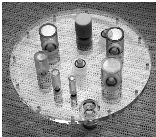
FIGURE 2. Modified faceplate used with Jaszczak Deluxe Flangeless ECT Phantom for PET phantom acquisition.

assessments, defines areas for improvement, and provides recommendations about the performance of nuclear medicine or PET studies. Facilities that successfully meet all of the criteria will be awarded a 3-y accreditation, a certificate, and a decal for each approved unit specific to the modules performed on that unit. The ACR will provide facilities with marketing tools and press release assistance. For referring physician and patient information, accredited nuclear medicine and PET facilities will be listed on the ACR Web site.