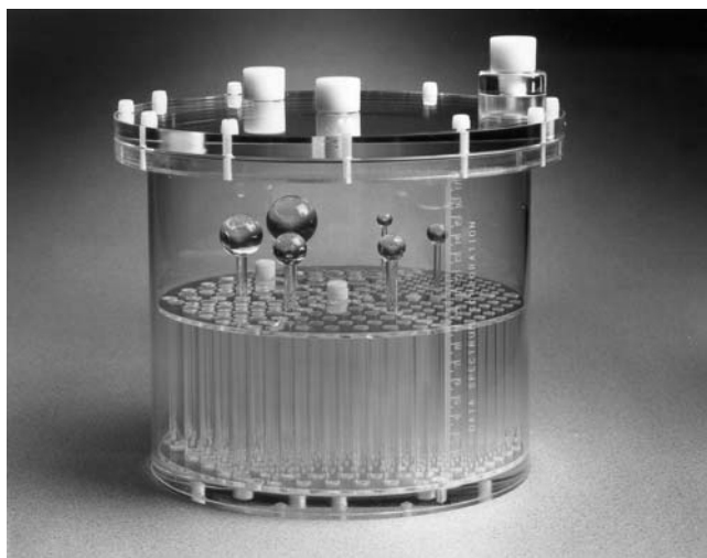
FIGURE 1. Jaszczak Deluxe Flangeless ECT Phantom.

submit planar and SPECT (if performed at the site) images for review with the ACR-approved phantom, the Jaszczak Deluxe Flangeless ECT phantom (Data Spectrum), on all units. The phantom is a cylinder with an internal radius of 10.8 cm. The lower portion of the cylinder contains 6 sets of acrylic rods arranged in a pie-shaped pattern and with the following diameters: 4.8, 6.4, 7.9, 9.5, 11.1, and 12.7 mm. The upper section contains 6 solid spheres with the following diameters: 9.5, 12.7, 15.9, 19.1, 25.4, and 31.8 mm (Fig. 1). The phantom acquisition requirements may differ from those normally used by the facility but were designed to minimize variability in images submitted by different facilities. Phantom images are scored by a panel of qualified medical physicists who have participated in review process training. The physics subcommittee has set standards for uniformity, noise, spatial resolution, and contrast.