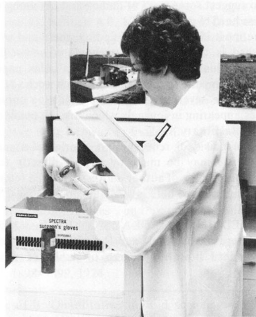
FIG. 2. Technologist using table-top shield for dose preparation.