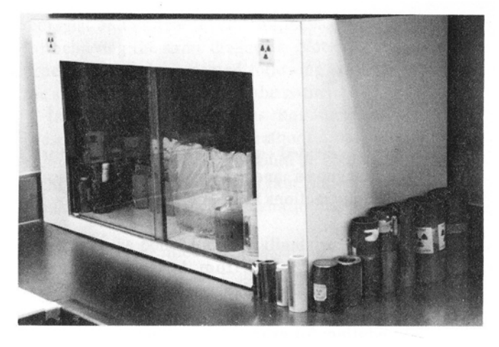
FIG. 3. Custom built storage cabinet.

The cabinet shell is constructed of leaded plywood with the Formica bonded to all outer surfaces and to the inside floor of the structure. The sliding doors are made of two \frac{1}{4} -in. pieces of leaded glass. The total cost of materials and labor is approximately $500.00, which is a 65 to 75% savings when compared to similar commercial models. The outside dimensions are arbitrary and may be accommodated to the specific needs of the laboratory, which is an advantage to in-house construction of