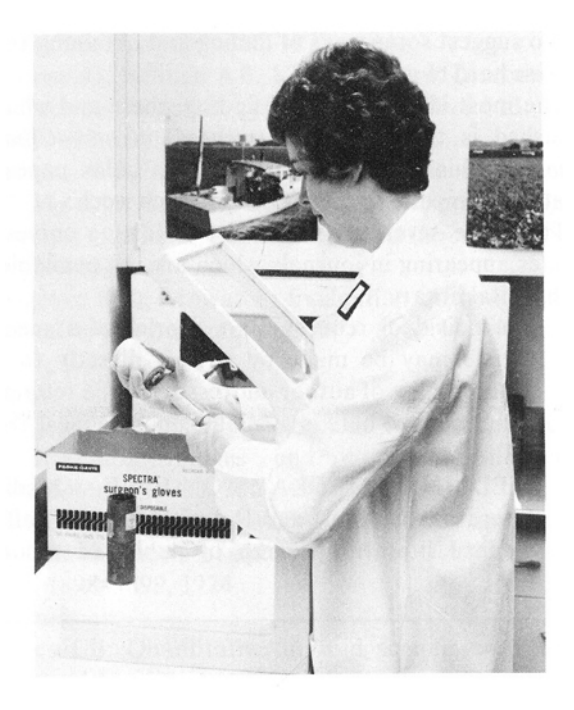
FIG. 2. Technologist using table-top shield for dose preparation.