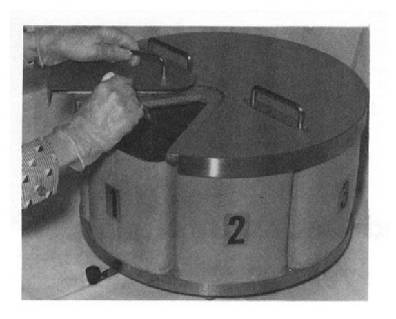
FIG. 3. Method of disposing of decayed materials.