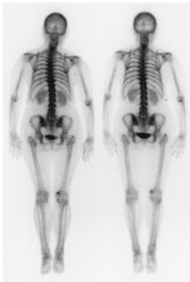
FIGURE 1. Posterior whole-body bone scan (right) obtained using a thick, slit crystal gamma camera system (Duet TM ; Siemens Medical Systems), compared with the same scan (left) acquired on a conventional \frac{3}{8} -in gamma camera system (e.cam TM ; Siemens Medical Systems).

The use of a new scintillation material, lutetium oxyorthosilicate (LSO), is being investigated. LSO has a much higher stopping power than NaI for 511-keV annihilation photons and nearly 75% the light output of NaI, but significantly more light output than BGO (8). Moreover, it is a faster scintillator, thus allowing higher counting rates than both NaI and BGO crystals. Table 1 provides the relative characteristics of nuclear medicine scintillation crystals. LSO is naturally radioactive; if used for single-photon work, corrections must be applied. Nonetheless, its use in PET and PET/SPECT imaging systems has been realized, and prototype units are undergoing initial clinical trials ( R. Nutt, PhD, Oral Communications, Nov 2000 ). Currently,