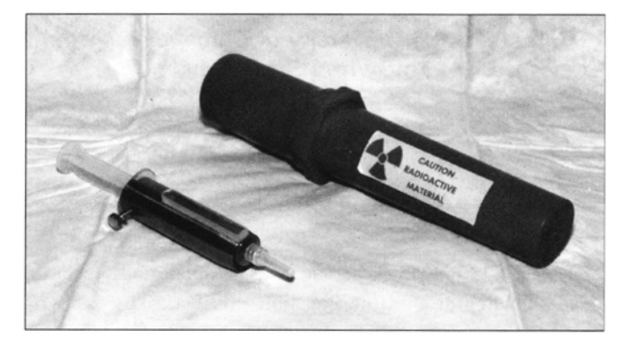
FIGURE 4. A tungsten syringe shield (left) and a standard lead pig (right).

tungsten is more expensive than lead, a tungsten shield will be significantly smaller, weigh slightly less and be more durable than a lead shield. In addition, a tungsten shield will avoid potential concerns related to lead toxicity.