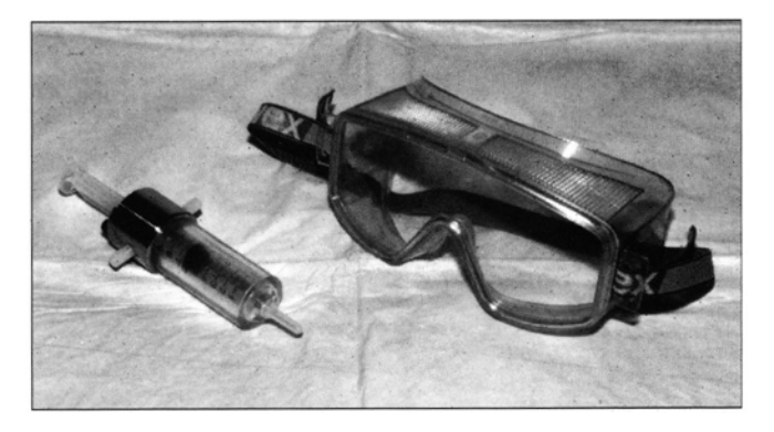
FIGURE 3. The University of Chicago positron shield (left) and a pair of industrial safety goggles (right).

We are presently constructing a system with an integrated dose calibrator using 20–25-mm-thick tungsten. This amount of tungsten should absorb 98% of the gamma photons. While