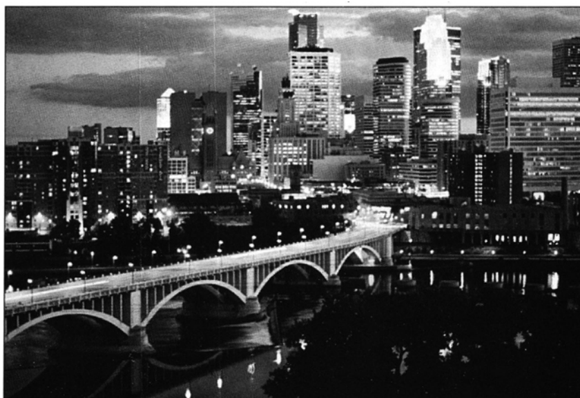
The dynamic shapes and dazzling colors of the skyline remind visitors that Minneapolis is a world-class metropolitan center.