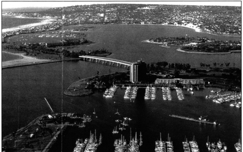
Despite the balmy February weather in San Diego, SNM-TS members were busy at work at the Mid-Winter Meeting. Fortunately, more than a few members managed to get away for some recreation under the sun.