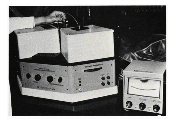
FIG. 2. Aminco Bowman spectrophotofluorometer.

is done by weighing out the proper amount of thallium chloride powder and placing this in a volumetric flask, then adding purified water to the exact volume of the volumetric flask. Avoid contact with or inhalation of the toxic thallium chloride chemical.