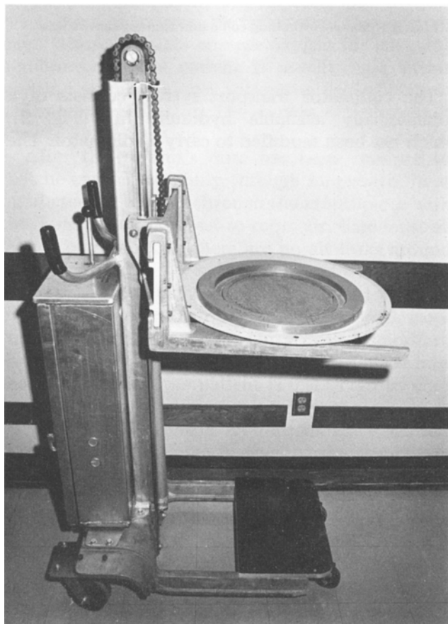
FIG. 2. Hydraulic lift modified to accommodate collimators.

and (B) the collimators could be transported and raised or lowered to the appropriate position as swiftly as possible.