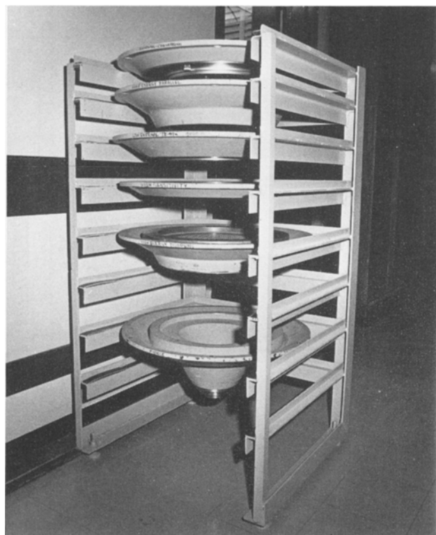
FIG. 1. Vertical collimator rack constructed of steel angles to accommodate eight collimators.

We were anxious to devise a system in which (A)