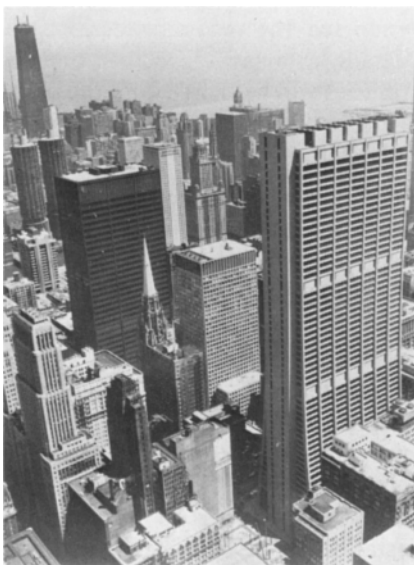
Chicago's imposing skyline, ready to accept the world of nuclear medicine in June.

The American Society for Medical Technology withdrew from the Board of Registry of Medical Technologists on Jan. 14 and announced its support of the new National Certification Agency for Medical Laboratory Personnel, which is planning to offer certification examinations by this summer. The split marked a break in more than 40 years of cooperation between the ASMT and the American Society of Clinical Pathologists, which jointly governed the Board of Registry.