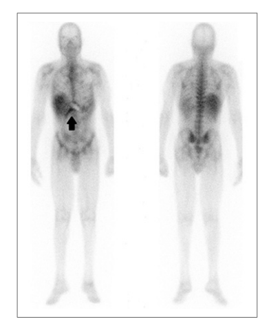
FIGURE 1. Planar anterior and posterior images from whole-body <sup>67</sup>Ga scan demonstrate curvilinear activity inferior to rib cage near liver (arrow).

After administration of 1.9 MBq (5.2 mCi) of <sup>67</sup>Ga, whole-body and multiple planar views were obtained at 48 h. SPECT/CT images of the lower chest and upper abdomen were obtained for better anatomic localization. The planar images demonstrated abnormal curvilinear activity (Fig. 1) along the suspected course of the LVAD drive line site, which was confirmed by SPECT/CT findings showing abnormal activity along the drive line with and without attenuation correction. The SPECT/CT scan also demonstrated intense activity within the LVAD pump. This activity was not expected as it was not seen on the planar images. The nuclear medicine physician reviewed the non–attenuation-corrected images, which showed no abnormal activity within the LVAD pump (Fig. 2). The observations from the SPECT/CT study were interpreted as consistent with infection of the LVAD