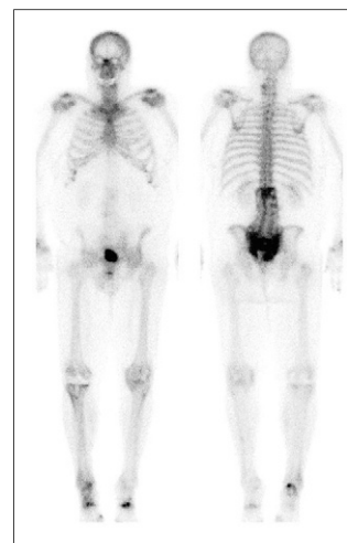
FIGURE 1. Anterior (left) and posterior (right) whole-body bone scan images showing classic H-sign in posterior view of pelvis. Some postoperative changes are noted in lumbar screws and right knee prosthesis, and degenerative changes are also seen in cervical spine and appendicular joints.

We have demonstrated a rare case in which the Honda sign on bone scanning with SPECT/CT led to the diagnosis of sacral insufficiency fracture. This case suggests that a sacral