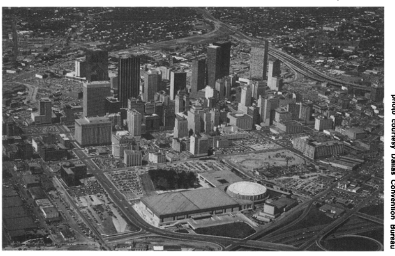
Aerial view of downtown Dallas, with the Convention Center in the foreground.

The Society's program will feature a new series of lunchtime Fireside Chats. Twenty educational sessions have been organized to provide an easy and relaxed method of sharing information while enjoying your