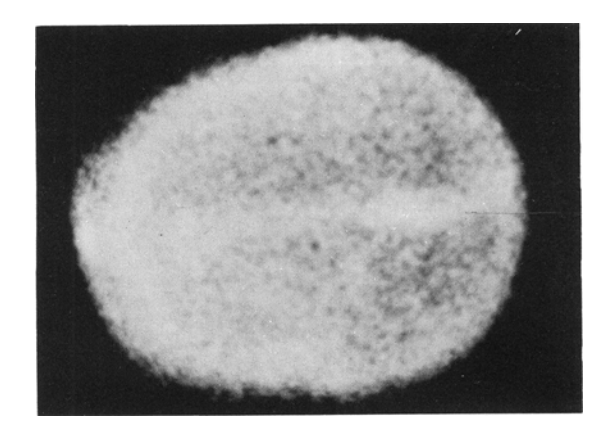
FIG. 3. Vertex image taken without device.

identifying cranial lesions. It is used to detect superior midline and parasagittal lesions, metastatic disease, and traumatic states (1). This communication describes a device that was constructed in our laboratory for the purpose of obtaining better vertex images.