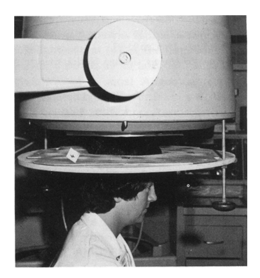
FIG. 2. Vertex imaging device mounted on camera. Note positioning of head diaphragms on top of device.