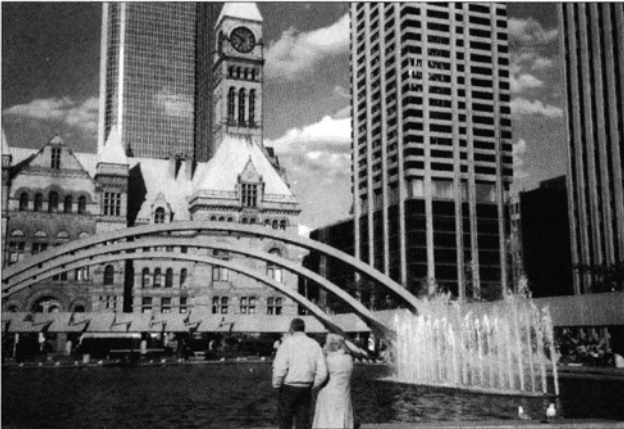
Attendees at SNM's 45th Annual Meeting enjoyed the cosmopolitan atmosphere of Toronto while attending meetings, courses and exhibits.

brought that concept to the national level with the Emerging Leaders Conference. At the awards ceremony in