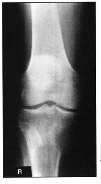
FIGURE 1. An anterior (AP) view of the right knee shows an osteolytic lesion in the proximal metaphysis of the medial tibia.

The general pattern of distribution of metastatic bone disease is more than 60% of metastases are in axial bones and 40% in the appendicular bones (1). With this pattern, the primary malignancy usually originates from breast or prostate. In lung cancer patients, appendicular bone deposits are more than that of axial bone (54.8% vs. 45.7%) (1). Our patient had