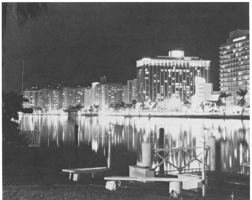
Miami Beach at night

Welcoming Cocktail Reception: Don't forget the opening reception, which will take place on Monday evening in the South Hall lobby of the Miami Beach Convention Center from 5:30 to 7:30 pm. Everyone who will be attending the meeting is welcome to attend.