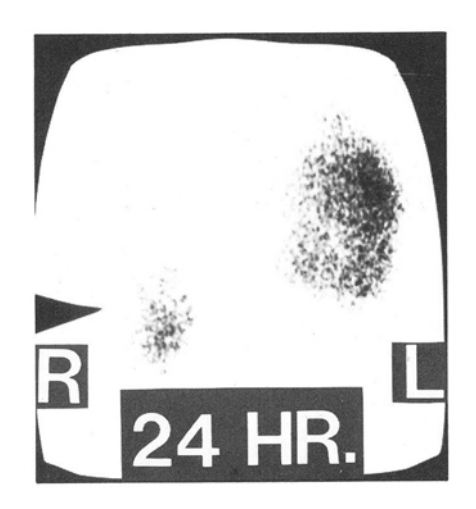
FIG. 1. Twenty four-hour film taken in AP position shows area (indicated by arrow on right) of increased activity in region of cecum.