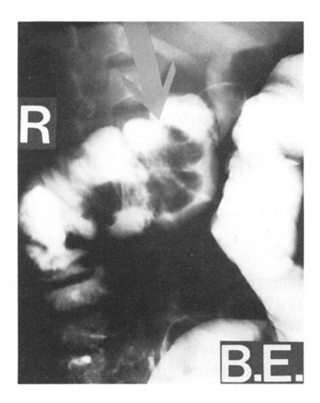
FIG. 3. Arrow indicates location of large polyp in proximal portion of transverse colon.

For obvious reasons, emergency studies are